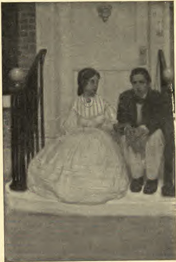
SUE SAW THE CHANGE IN HIS MANNER.